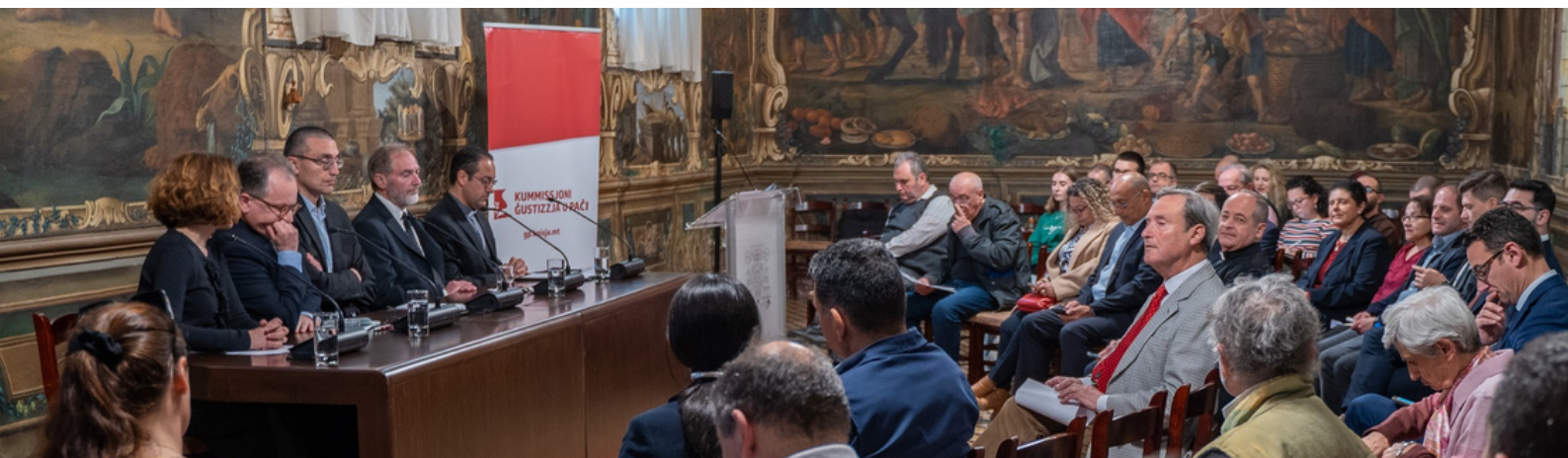
Expert-panel discussion on neutrality which was held at the Archbishop's Curia.

As part of the programme of activities organized by the Archbishop's Curia during its open day, the Commission held a workshop on the theme of economic growth.