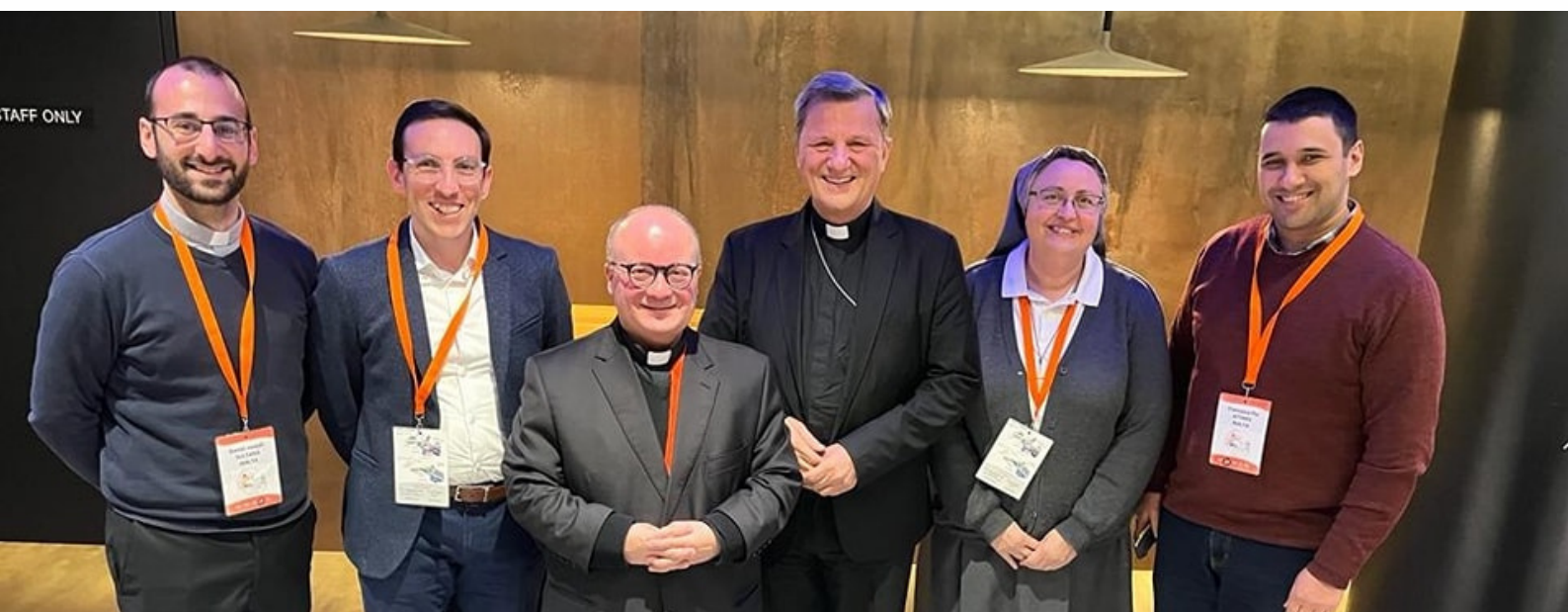
Cardinal Mario Grech, Secretary General of the Synod of Bishops, together with the Maltese and Gozitan delegation during the Continental Assembly of the Synod in Prague.