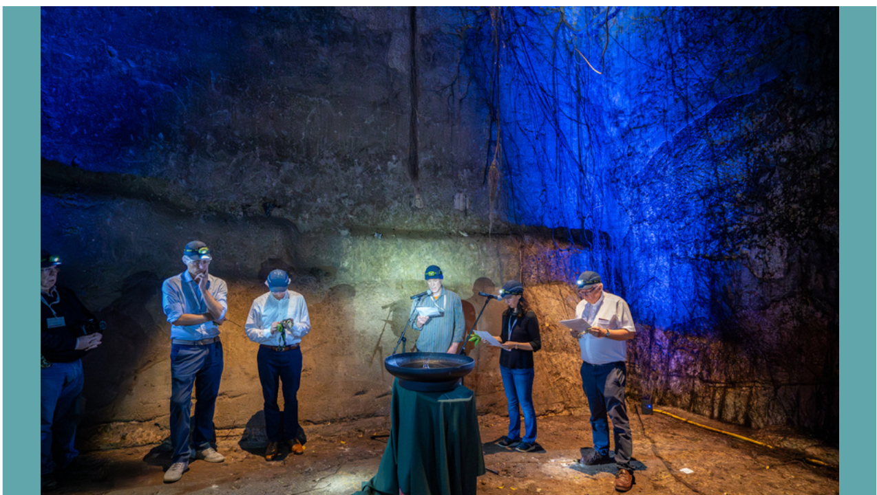
Symbolic Action for peace and justice which took place in Underground Valletta.

The works of the General Assembly concluded on Monday with Mass presided by Bishop Galea Curmi in the chapel of St Calcedonius in the Archbishop's Curia.