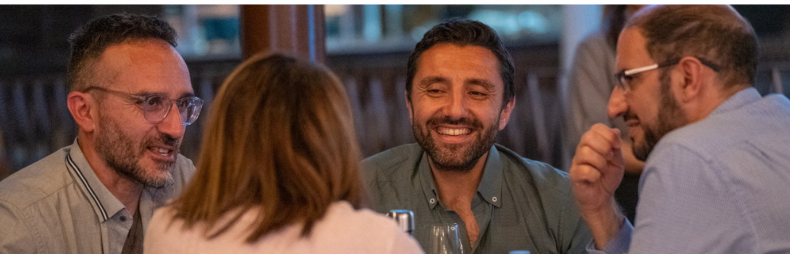
Rethink.mt public dialogue held at Suq tal-Belt.

Members of the public were invited to join in the conversations and discuss topics including migration and cultural heritage.